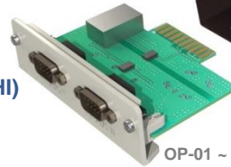
OP-01 ~ OP-07