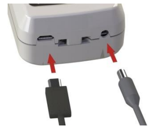
Micro USB or DC jack