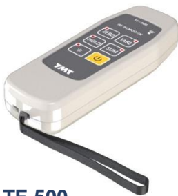
TF-500 (ZigBee Remote control)